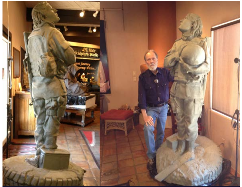
“Athena's Prayer” - Lifesize clay in-progress