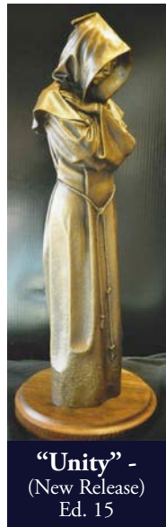
“Unity” - (New Release) Ed. 15